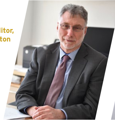
ICFJ Founders Award for Excellence in Journalism